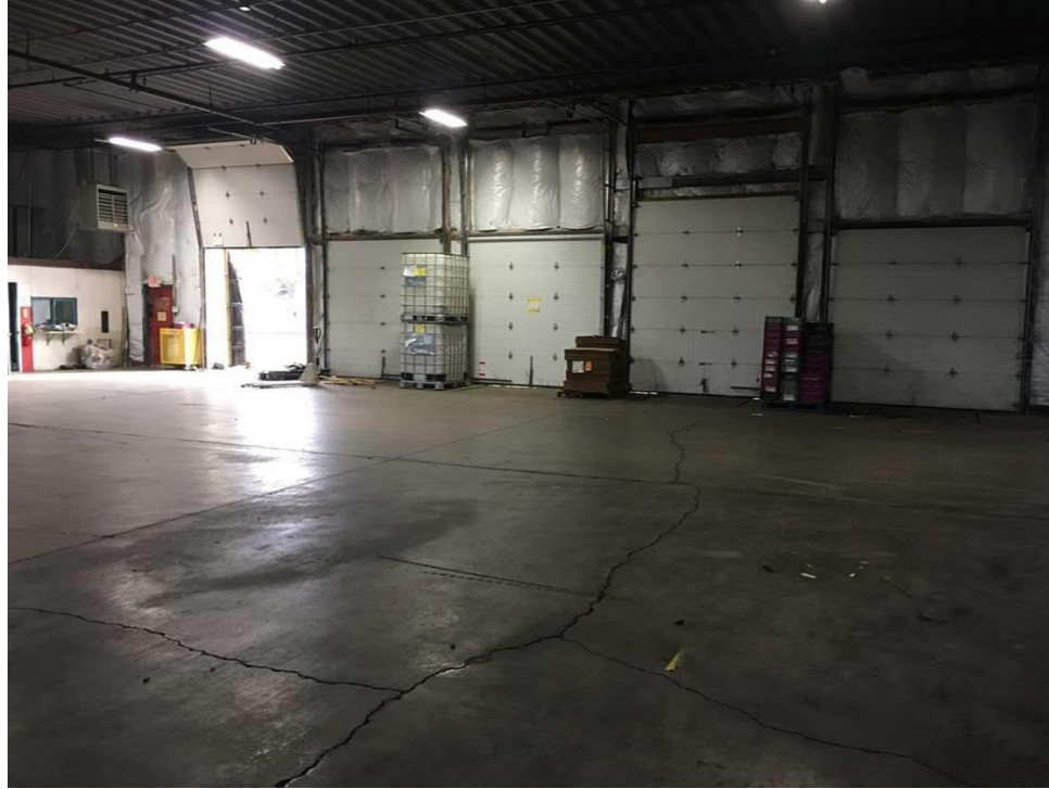
Four working Docks on east wall at north end.