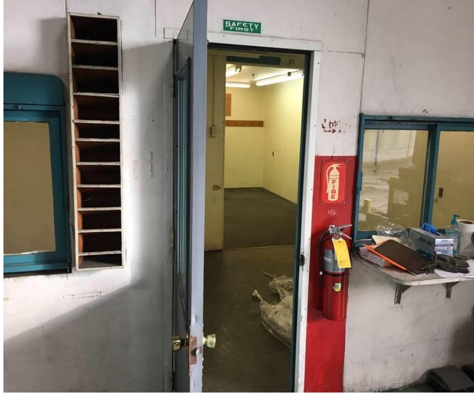
Above is the small office by the entrance and docks.