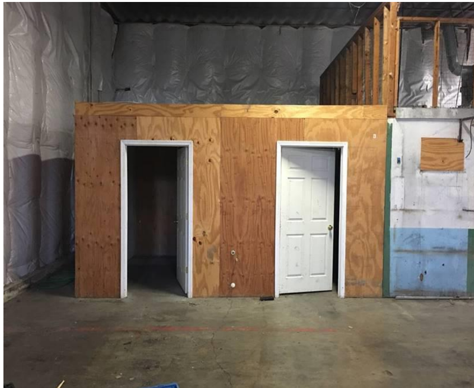
Above are the 2 bathrooms we added 4 years ago.