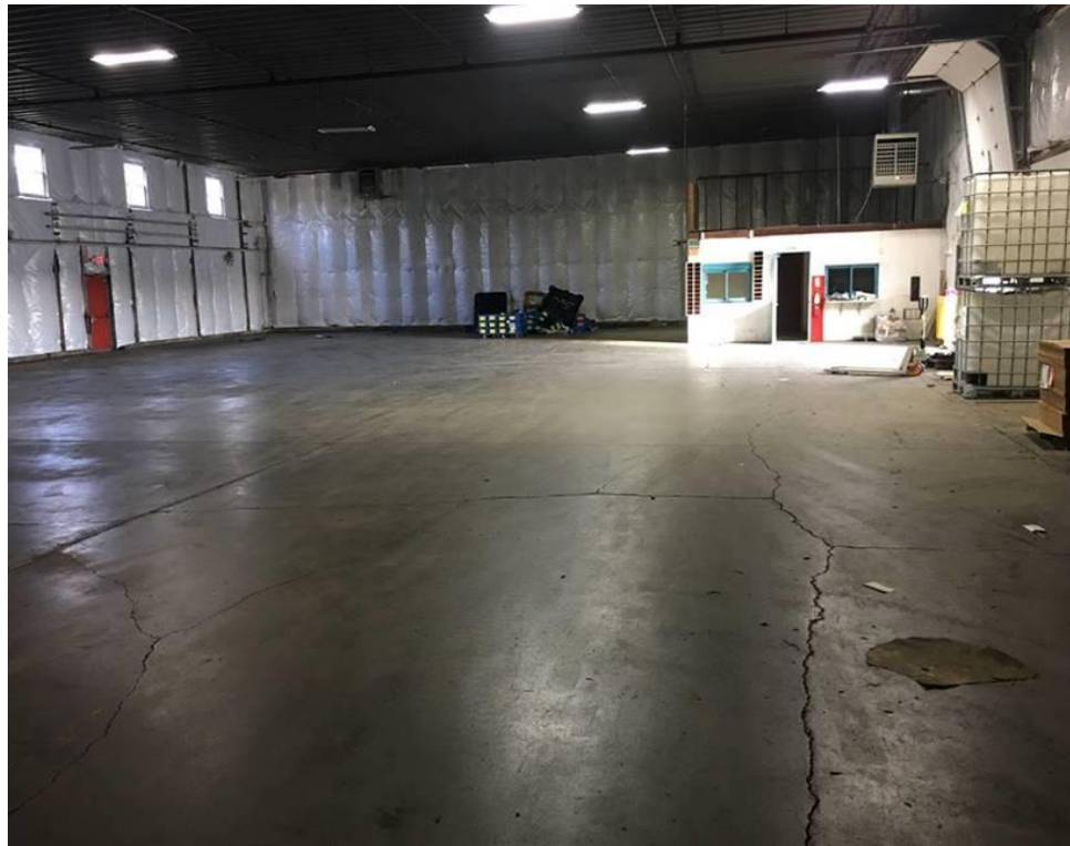
North side of the space showing the office and bathrooms to the right.